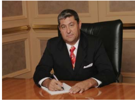
Leader, CKO (Chief Knowledge Officer) Coast-To-Coast, LLC Publisher, Author Coast-To-Coast Communications & Publications, LLC Agent, Coast-To-Coast Realty Advisors, LLC

Co-Author of “How to Make More Money in Self-Storage”